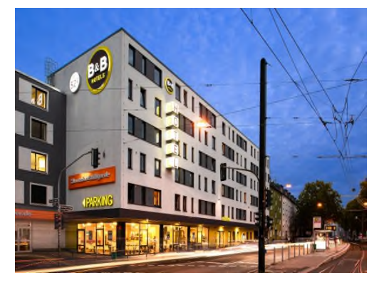
B&B Hotel Düsseldorf – Bahnhof Kettwiger Str. 6 40233 Düsseldorf