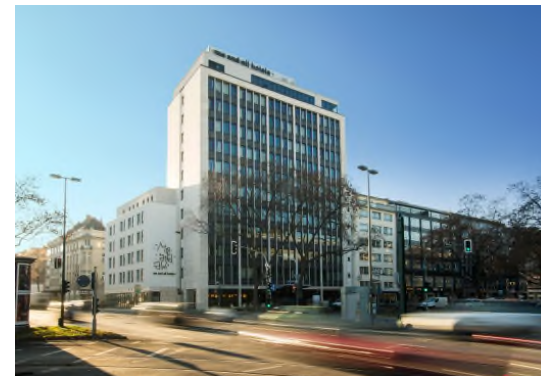
me and all hotel düsseldorf Immermannstraße 23 40210 Düsseldorf