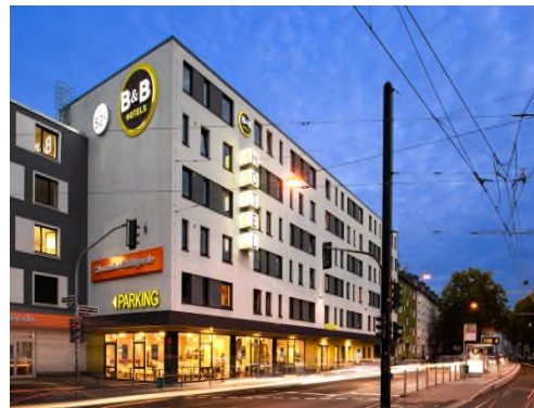
B&B Hotel Düsseldorf – Bahnhof Kettwiger Str. 6 40233 Düsseldorf