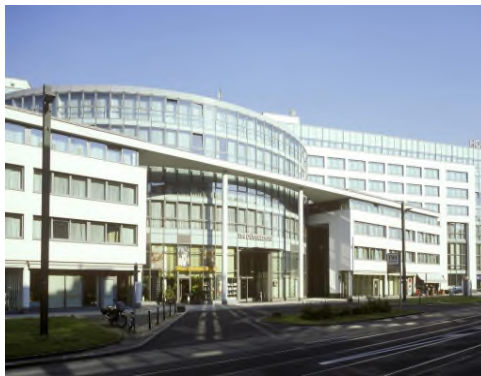
Hotel NH Duesseldorf City Kölner Str. 186-188 40227 Düsseldorf